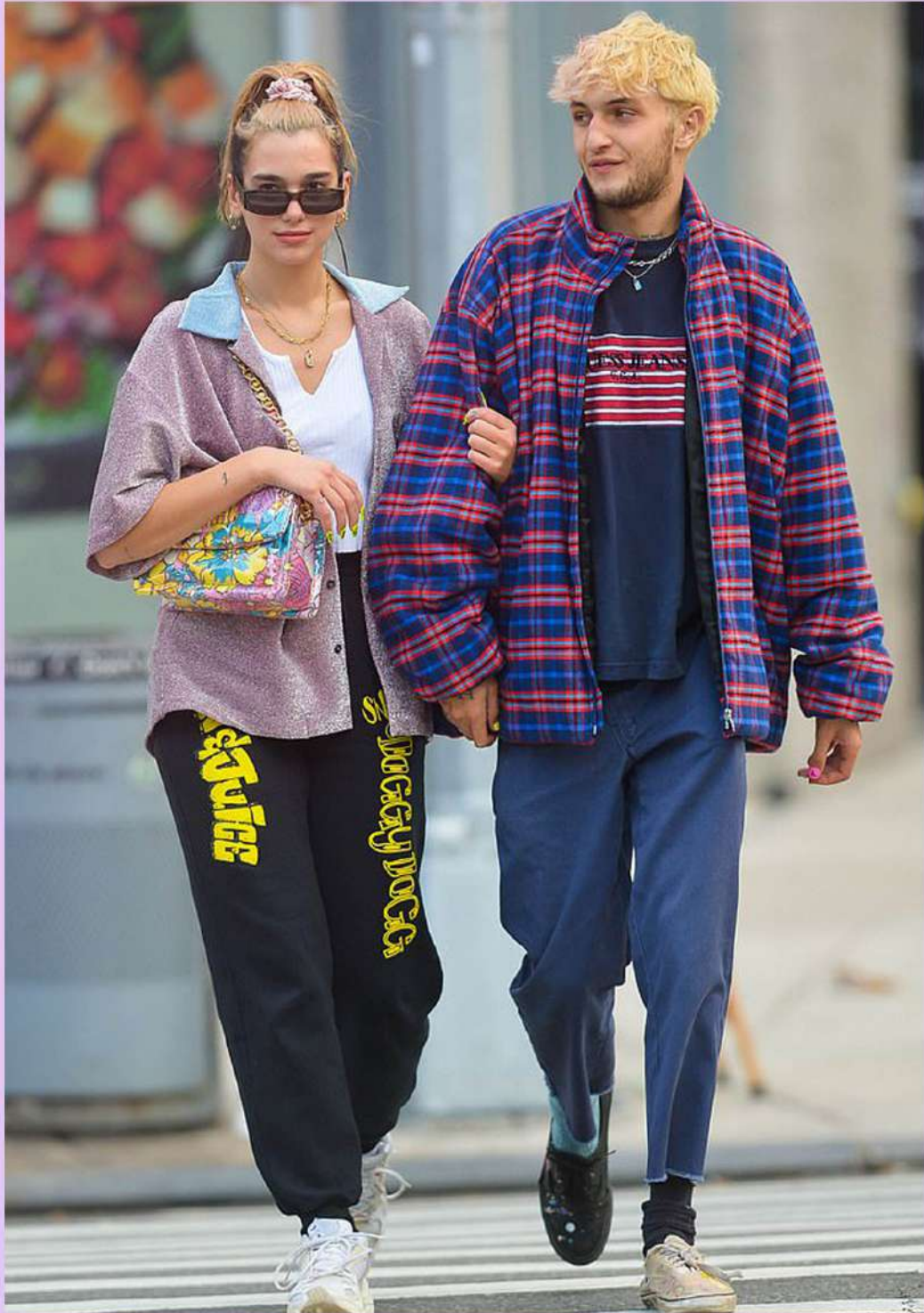
DUA LIPA WEARING THE NUNZIO PINK GLITTER SHIRT